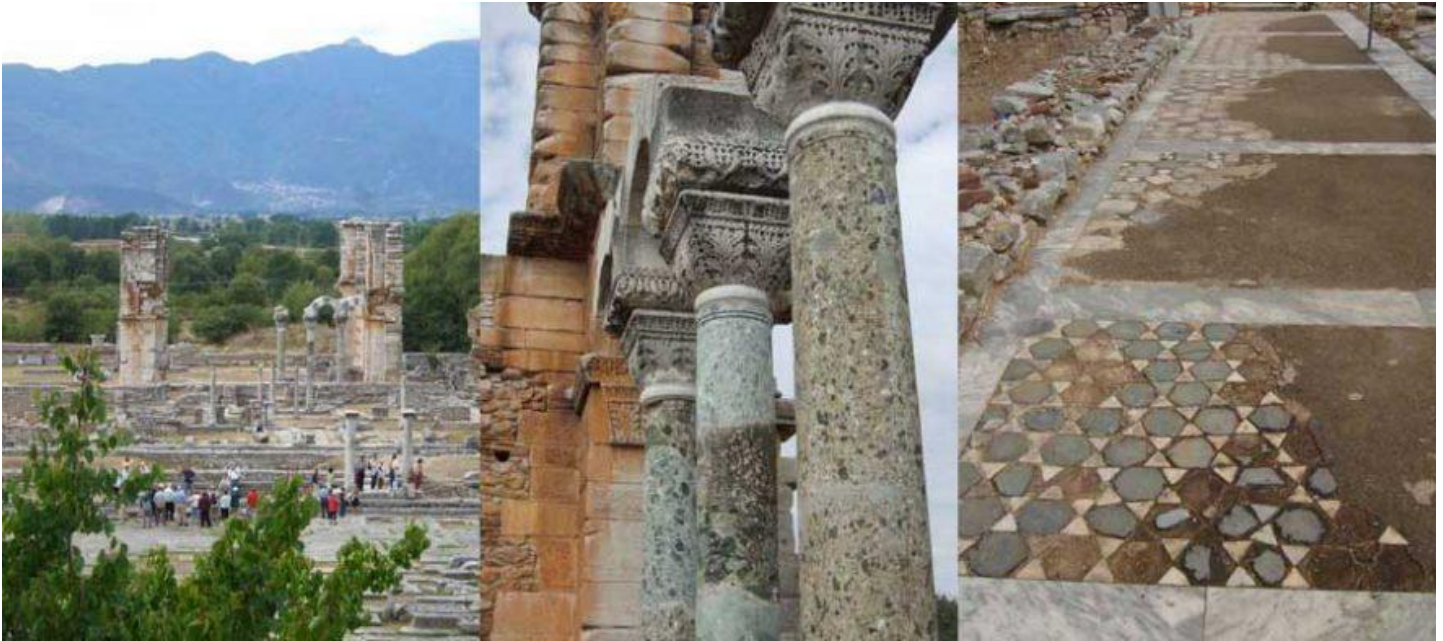
Ancient Philippi in northern Greece

Paul's (and Timothy's) letter to the saints in Philippi in Greece was probably written around 62 A.D. from Rome. Philippi was the location of the first Christian congregation in Greece and it became an important center for Christianity. Because this epistle jumps from one subject to another, scholars think it may be a composite of several letters.