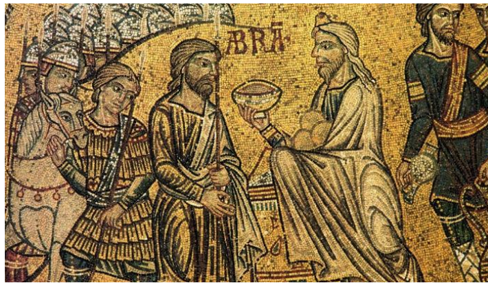
Abraham and Melchizedek